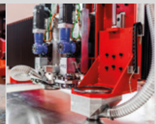
CSRS Caterpillar Stack Routing System